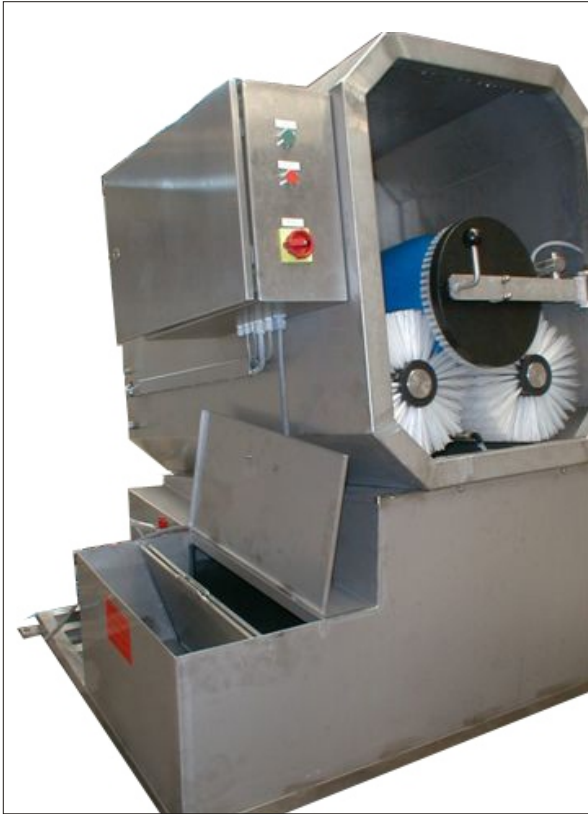
GemiClean DW model.