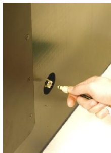
SO 2 gas inlet