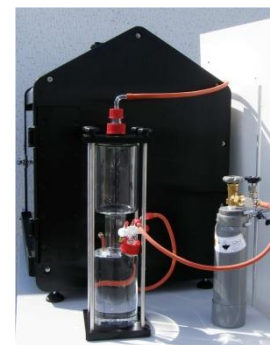
Front and side view of the glass cylinder for manual gas dosing