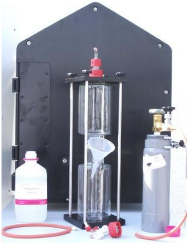
Accessories for conducting KES